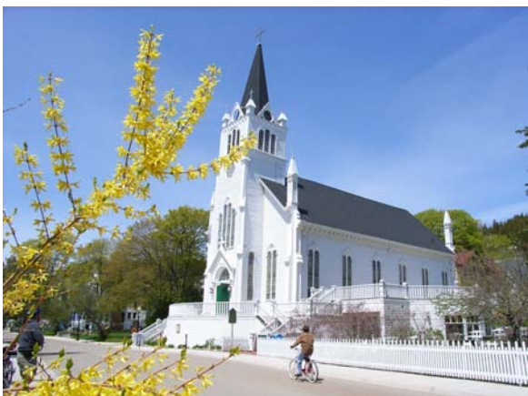
St Ann Church, Mackinac Island

Entering Mackinac Island in a drizzling rain doesn't really take away from its charm and uniqueness. We picked a slip and backed in since all the pier heads were pretty short. There aren't many boats in the water because it's so early in the season, but the ferryboats are buzzing back & forth getting folks from the island to the mainland, some visitors and some workers that don't live on the island. Since the rain is continuing, we ate on board and just relaxed taking in the scenery around us.