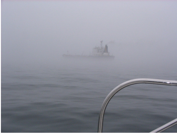
Encountering a large freighter in fog

A blip on the radar at the one o'clock position showed something moving toward us. Karen went right up to the front windows to watch closer and soon saw an object, which was coming closer and turned out to be a large freighter. Had we not seen it and continued on our course we may have experienced a very close encounter. Never hurts to be too diligent in fog.