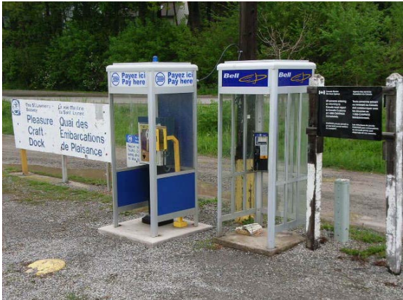
Toll booth and Customs booth