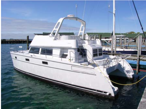
PDQ 41 Power Catamaran